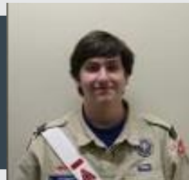
Mason Mansell Communications